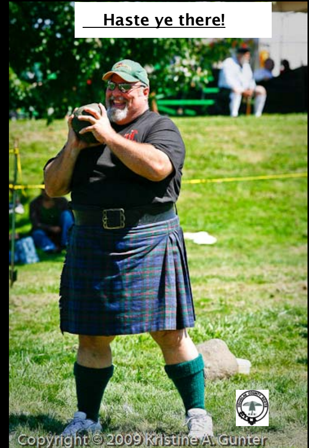
Copyright © 2009 Kristine A. Gunter