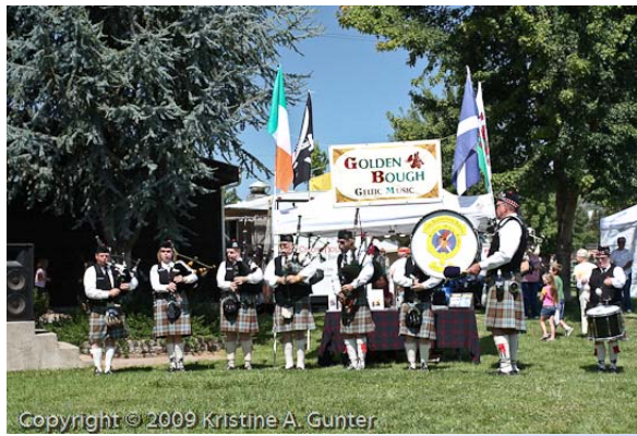
Copyright © 2009 Kristine A. Gunter.

The Douglas County Scottish Society was formed in 1990 and became a 501(c)3 nonprofit in 2005. We strive to educate people of all ages about Celtic culture. Your support and donations are welcome.